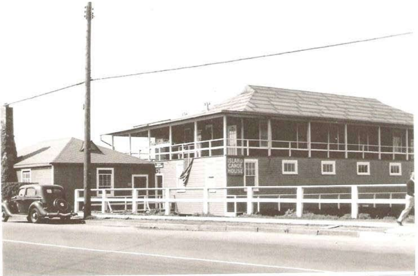
Island Canoe Club images