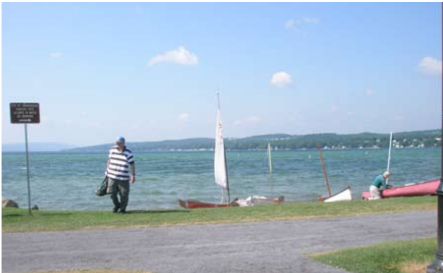
Canandaigua, NY in the Finger Lakes sail canoe cruising