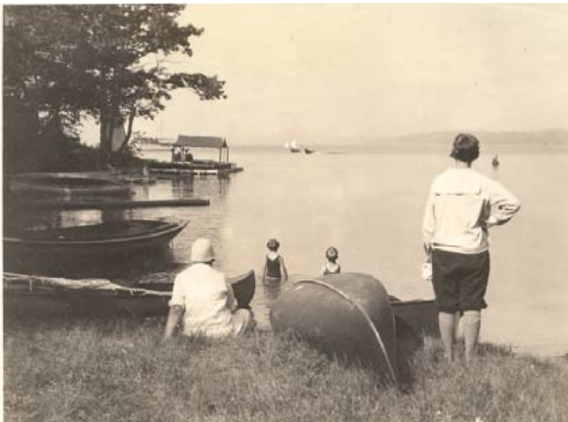
1928 Sugar Island Canoe Beach