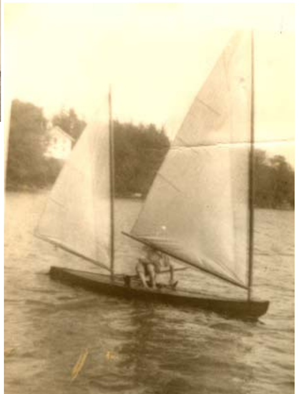
1920's sail canoe 16 x 30 "racing machine"